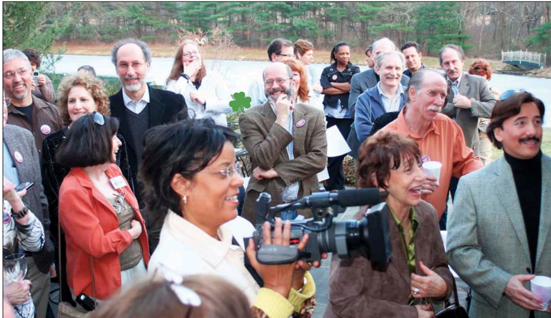
About a hundred supporters of the Coalition for Voting Integrity gathered to listen at Sunday's benefit.